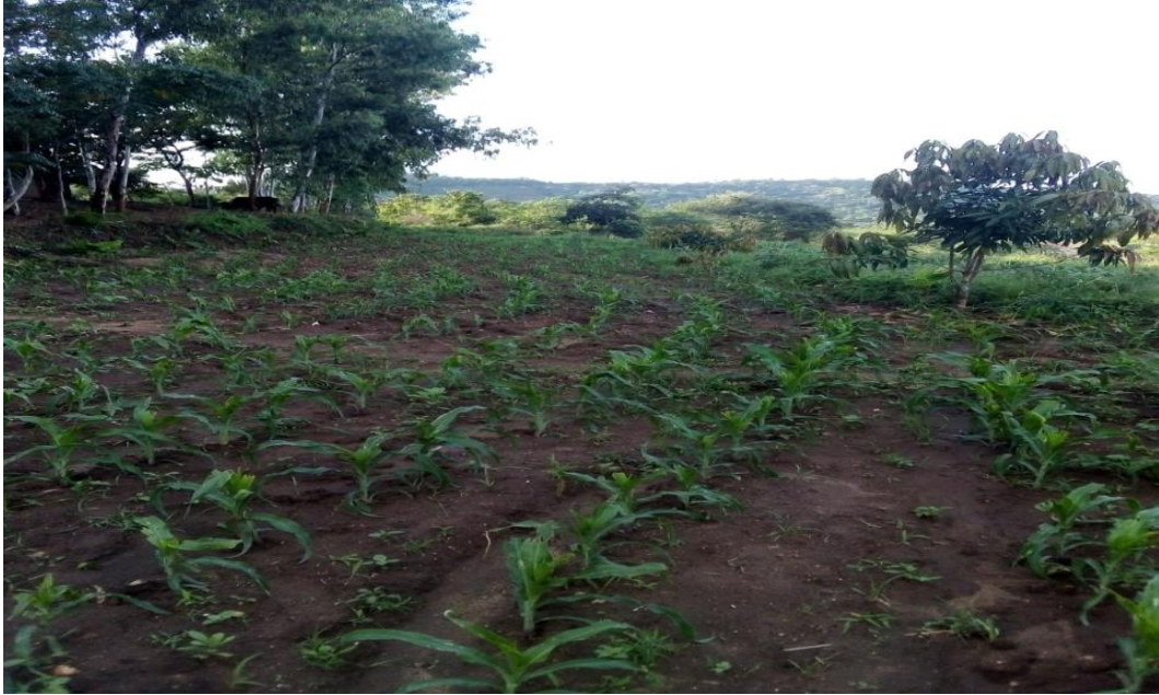
(b) Green grams Ward: Muvau/Kikumini date: 30/04/2022